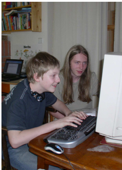
Vilda + Korsičan